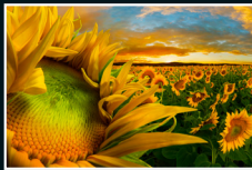
SEASONS & WEATHER