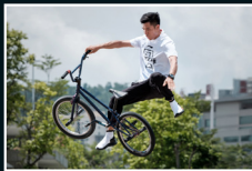
ALL ABOUT CYCLING