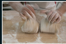
ALL AROUND BREAD

Ein erstklassiger Katalog mit zahlreichen Farbabbildungen für alle Einsender!!! A marvellous catalogue of excellent printing quality will be sent to all participants!!!