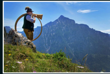
AUSTRIA AT ITS BEST