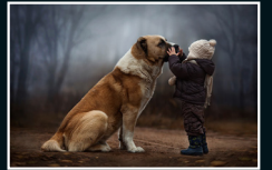
PEOPLE & PETS