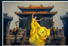
FINE FEATHERS MAKE FINE BIRDS